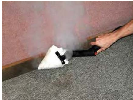
Steam treatment of the baseboard. Note that the wand is covered with a terry wash cloth to increase and retain heat.

It is recommended that a professional type steam machine with a large water-holding capacity (at least 4 L), many types of attachments, and variable output rates be used. Dry-steam or low vapour steamers are a better choice because they use and leave behind less moisture. When steam is used it should be immediately followed up with or in conjunction with vacuuming. Steam will flush bed bugs out of their hiding spots to be killed or vacuumed. Use a wide nozzle instead of a single-holed nozzle as it may concentrate the steam into a jet that can dislodge bed bugs allowing them to escape the effects of the heat. Move the steam cleaner nozzle slowly to maximize depth. A person using a professional steam cleaner should monitor the heat output of the steam, using a thermal monitor, to ensure surface temperatures are at least 80°C after the steaming nozzle has passed that surface. Depending on the baseboard thickness and crevices available it may be more effective to use a nozzle tip to place steam behind the baseboard.