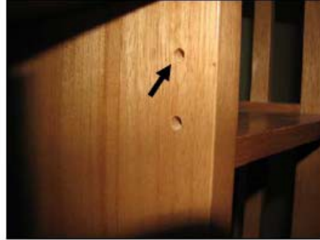
Tiny spaces in the bed frame and other furniture, such as a peg hole for a shelf, are ideal hiding spots for bed bugs.