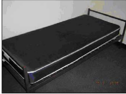
A metal bed frame and vinyl mattress will minimize bed bug problems if moved away from the wall.