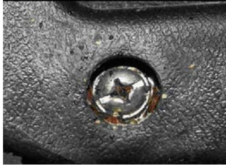
Bed bugs hiding in the screw hole of an office chair.