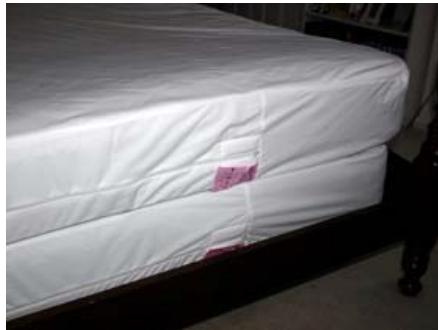
Use mattress and box spring encasements.