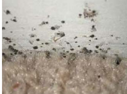
Bed bug eggs and faecal stains along the edge of the carpet.