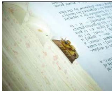
Bed bugs hiding in the tab of a dictionary.