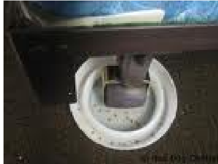
Bed bug interceptor. Bed leg is placed in the inner section. Talcum powder is incorporated in the interceptor to prevent bed bugs from climbing out.